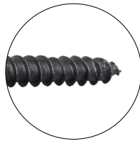
Tri-Forge™ Point Fast start, minimal splitting, reduced driving torque