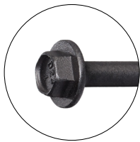
Hex Head For maximum driveability