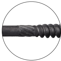
Speed-Knurl™ Reduces friction for faster installation