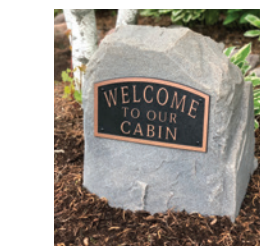
115 Rock with 653H-L-CB Address Plaque