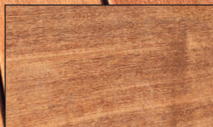
Treated with Ipe Oil™

When it comes to deck building, we all want it to last a long time. We want the natural wood color to show and sometimes even a grey deck appearance is our preference. However, with time, wood decking gets dirty and loses its' luster and natural hardwood appeal.