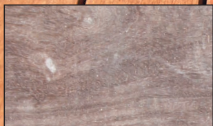
Before Part 1