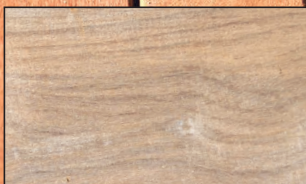
Cleaned with Part 1 & 2