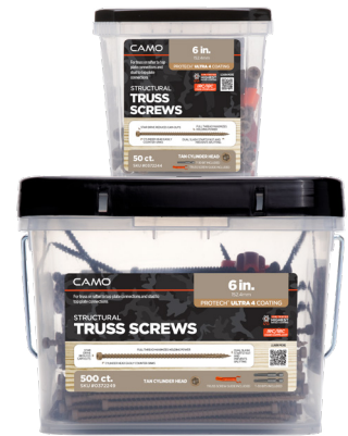
AVAILABLE IN 50CT AND 500CT.

Our industry-leading coating protects your connections against the harshest environmental elements. And we've got your back - our products are guaranteed by a Lifetime Limited Warranty. Trust CAMO® when your connections count. Read the full warranty at camofasteners.com