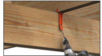
BEAM TO JOIST