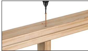
DOUBLE TOP PLATE TO STUD