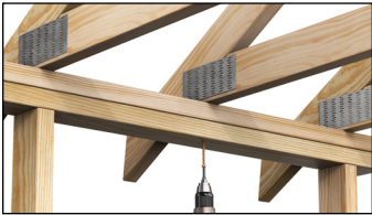
DOUBLE TOP PLATE TO TRUSS+RAFTER