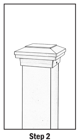
Fasten post cap to the post using 2 each provided screws or silicone adhesive.