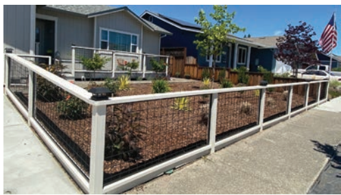
Black Hog Panel with Hog Tracks