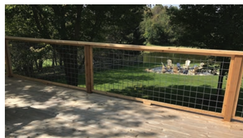
Silver Hog Panel