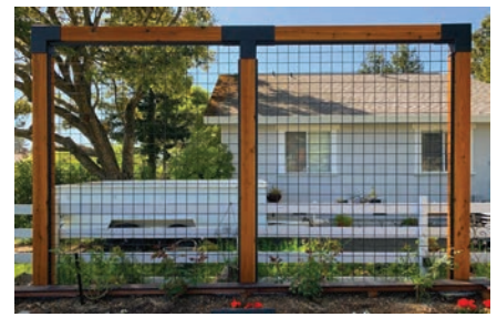
Black Hog Panel with Hog Tracks