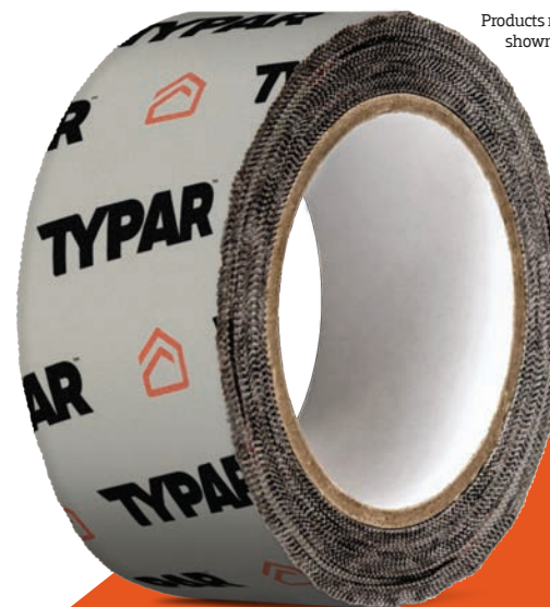
Products not shown to scale.