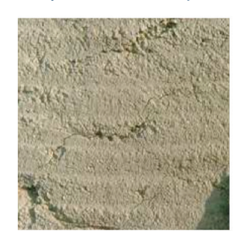
Stucco Mix 1 Tyvek® StuccoWrap®