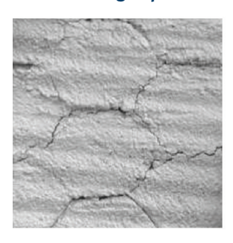
Stucco Mix 1 Building Paper