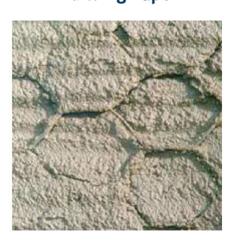
Stucco Mix 2 Building Paper