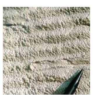
Stucco Mix 2 Tyvek® StuccoWrap®