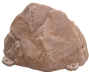
AB - Autumn Bluff

Dekorra Rock Enclosures are realistic, well-made, and available in 4 colors*