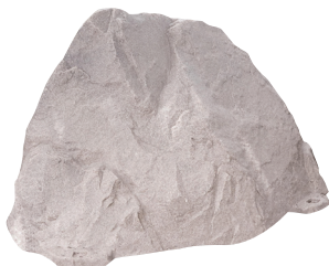
FS - Fieldstone