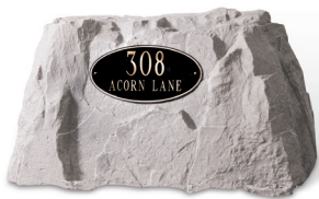
110 Rock with 650-L-GB Address Plaque