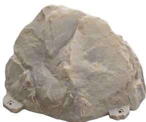
SS - Sandstone

* Each rock is unique and colors will vary.