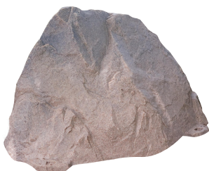
RB - Riverbed