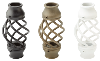
Decorative Baluster Baskets