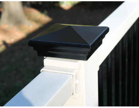
Designer Caps & Collars