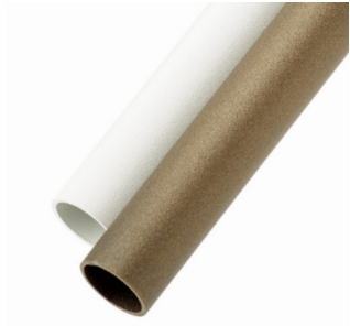
Optional White or Bronze Balusters